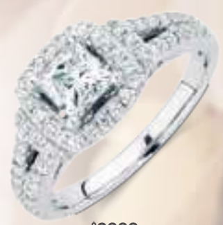
$6999 11/4 carat of diamonds 12427369