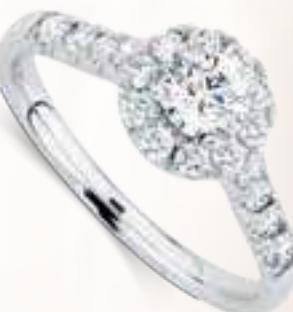
1 carat $\frac{3299}{6999}\] 12427765