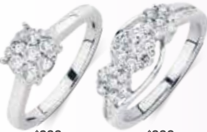
1/2 carat of diamonds 10kt gold 12430635

Our multi-stone designs feature an expertly set mosaic of diamonds to create a massive look at a superb price.