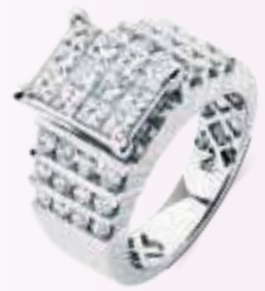
NOW $3999 2 carat of diamonds 19/13/1581