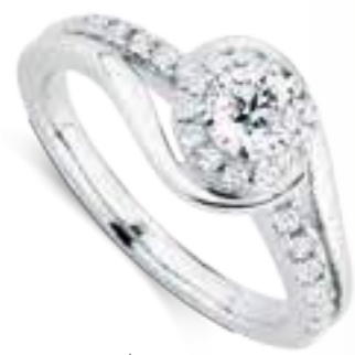
$2999 3/4 carat of diamonds