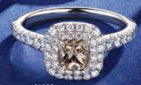
$4299 11/3 carat of diamonds

The Southern Star is our proprietary 90-facet radiant cut diamond. Extra facets & superior proportions produce a fire & brilliance quite unlike any other diamond.