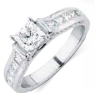
1 carat $\$3999 \quad \text{12416615} \\ 13\% carat $\$\$10,999 \quad \text{12416837}