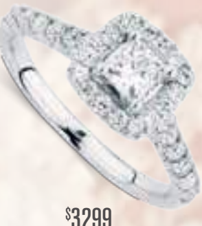
1 carat of diamonds 12427314