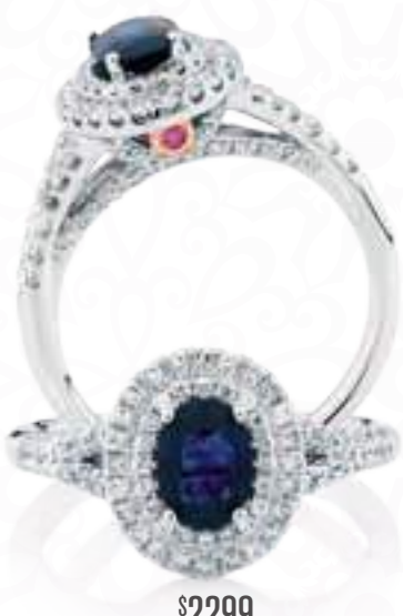
Sapphire<sup>Ø</sup> & ½ carat of diamonds